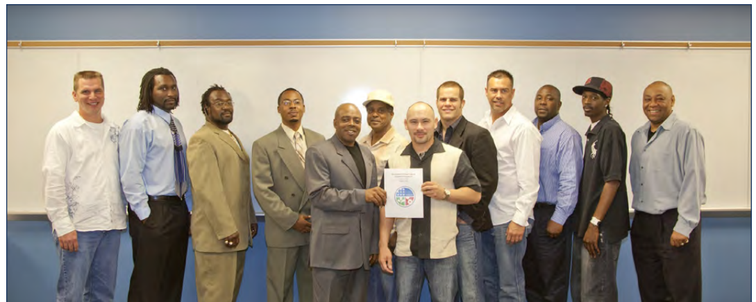
Brownfields Job Training Graduating Classes from St. Louis, Missouri