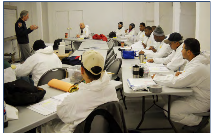
Students in Richmond, California's Job Training Program

Earlier this month, 5 graduates of the program were hired by Global Diving, a private firm providing skilled technicians to clean up the BP Gulf Oil Spill. Those