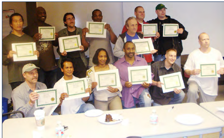
Graduates of King County Washington Jobs Initiative

King County, Washington — In Washington State, the King County Jobs Initiative (KCJI) helps formerly incarcerated County residents move beyond the stigma of jail time and into living-