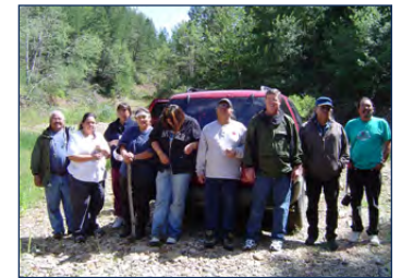
Students of Fort Belknap's job training program

Building on these and other efforts in the remote mountains, plains, and tribal territories of EPA's Region 8, the Brownfields Office